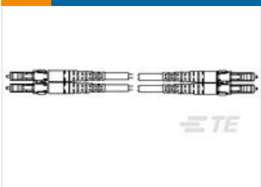
TE Part #2064915-3 C/A,F/O,2F I/O MM50 OM3,SCLC DPX