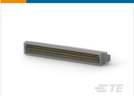
TE Part #650473-3 096 EURO TYPE C PIN ST ASSY