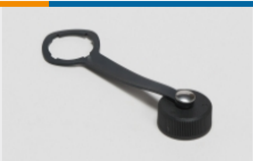
Modular Jack & Plug Caps & Covers(1)