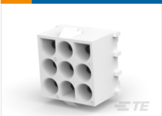
TE Part #2029002-1 09P UMNL HDR ASSY PC, NDH