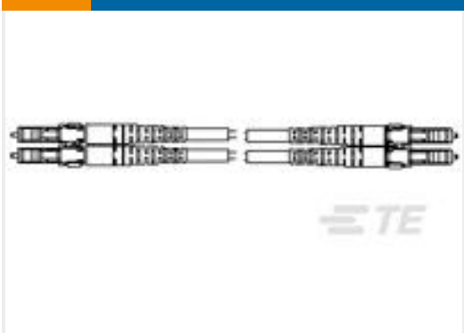
TE Part #2064915-8 C/A,F/O,2F I/O MM50 OM3,SCLC DPX, 8M