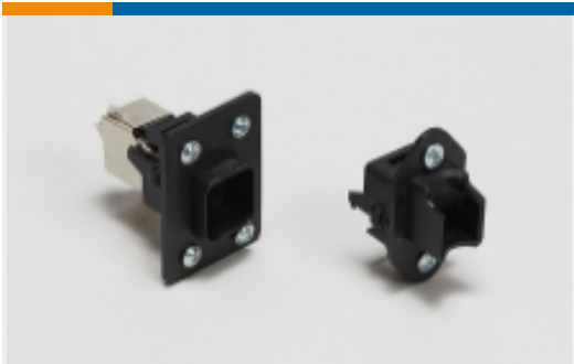
Circular Ethernet Hardware(3)