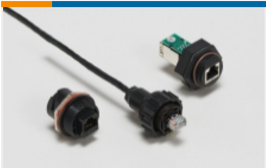
Circular RJ45 Connectors(6)