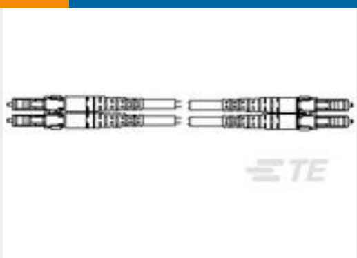
TE Part #2-2064915-5 C/A,F/O,2F I/O MM50 OM3,SCLC DPX