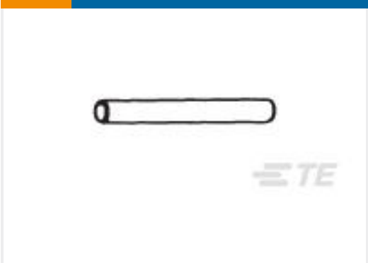
TE Part #1445886-1 RET PIN,75/120/180A,SP,1 HIGH